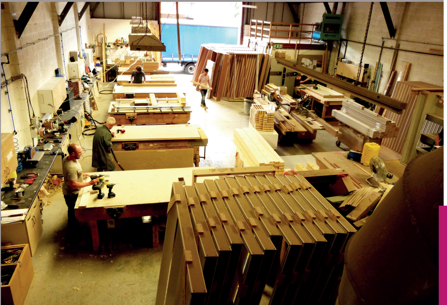
Door assembly shop