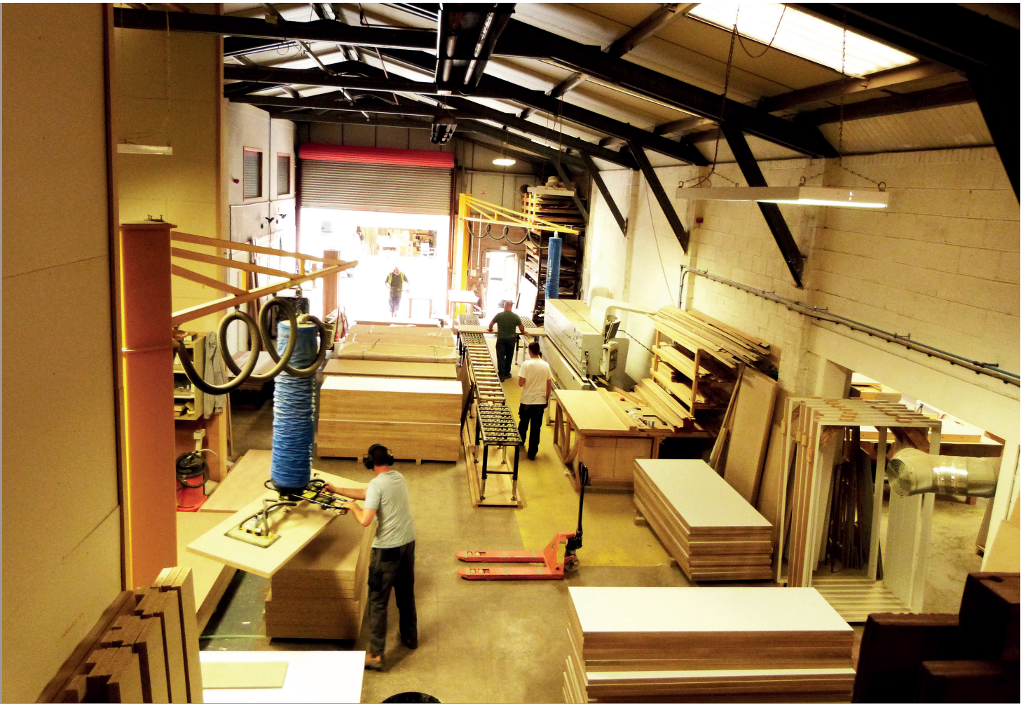
Door leaf production shop